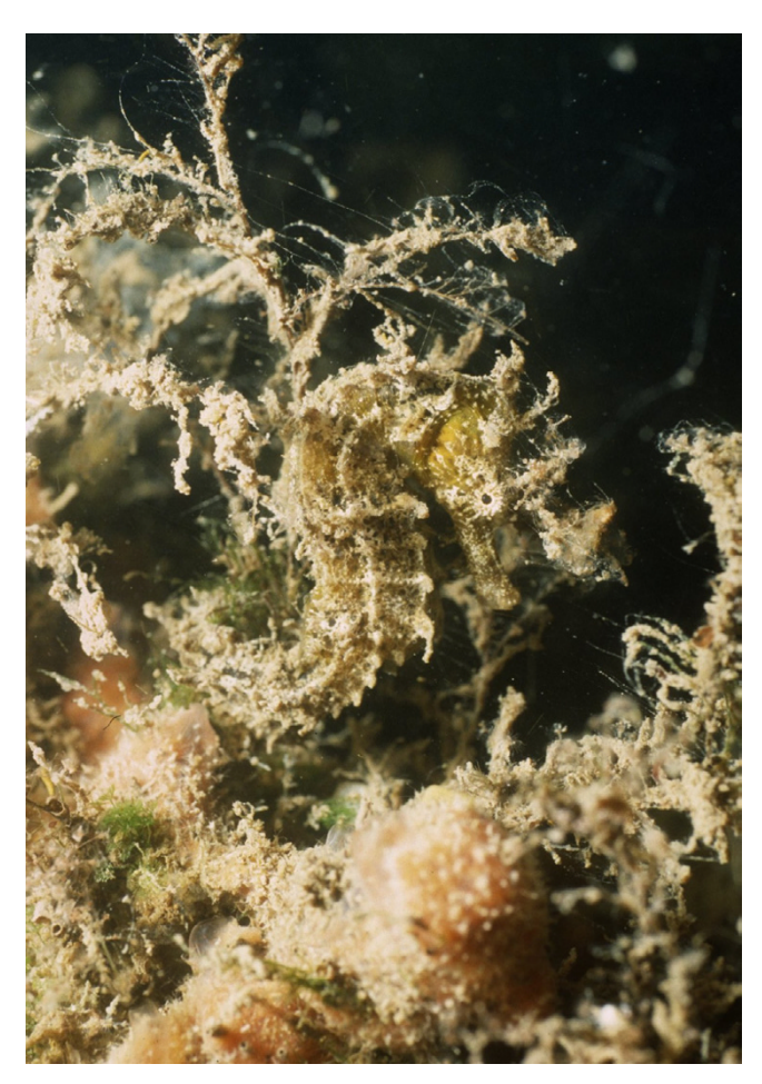
Figure 2 Camouflaged Hippocampus reidi , showing skin appendages.

from females by the presence of a ventral pouch in the former. 120 (81.6%) associated the presence of the ventral pouch with the female seahorse – "females have the pouch, they are the ones that caries the embryos – the natural way". Among the intentional fishers (n = 36), 15 (41.6%) associate the presence of the ventral pouch with the female seahorse, 19 (52.7%) associated it with the male seahorse. Two fishers did not answer the question. Among occasional fishers (n = 145), 105 (72.4%) associated the presence of the pouch with the females, while only eight (5.5%) associated it with the male seahorse. A total of 32 occasional fishers (22.1%) did not provide information on the topic.