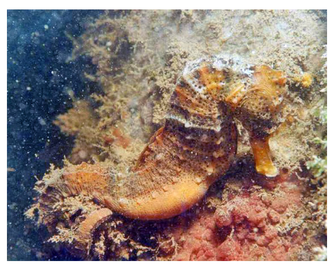
Figure 5 "Pregnant" male of Hippocampus reidi exhibiting ventral pouch.

Intentional seahorse fishers 66.6% (n = 24) said that populations have declined over the years, their present catch levels being much smaller than they used to be, and their capacity to choose seahorses by colour reduced. The following causes for the declines were mentioned by fishers: habitat degradation (aquaculture ponds, siltation, man-