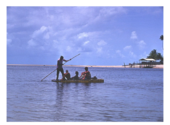
Figure 3 Seahorse fishers, Pernambuco State.

The prevailing view among interviewd fishers was that the female seahorse has the pouch (as expressed by some fishers, the "natural way"). Although that type of perception can sometimes be related to "machismo" [20], some fishers admitted that they were changing their opinion, because "a television program said that the male sea-