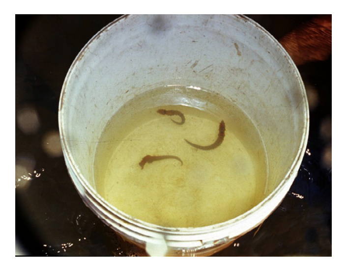
Figure 4 Type of container commonly used to keep the specimens of Hippocampus reidi harvested for the aquarium trade.

tures of "pregnant" seahorses have also been recorded in other parts of Brazil [16]. As an exporter country, Brazil has to comply to the listing of seahorses in appendix II of CITES, and demonstrate that captures of seahorses are non-detrimental to wild populations. Therefore, feasible management options addressing the capture of brooding seahorses should be sought after in the country.