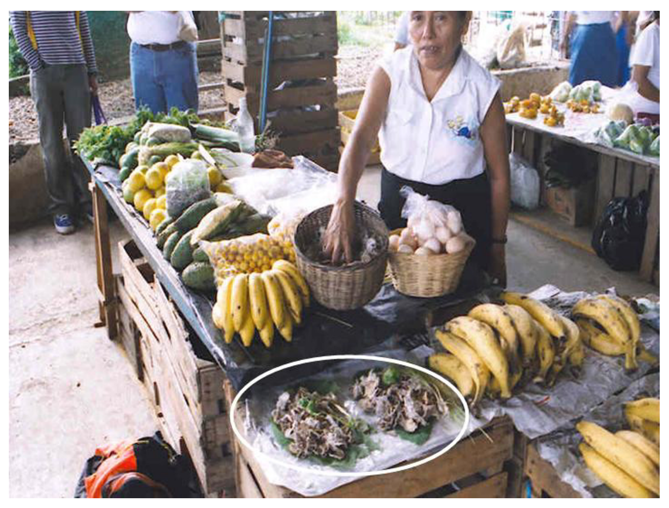
Figure 3 Typical wild mushroom stand in Mexican tropics, mushroom are signaled by an ellipse.