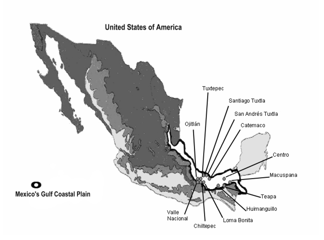
Figure I Mexican Gulf coastal plane and studied sites location. Modified from Rzedowski (1981).

knowledge in patterns of mushroom consumption and use