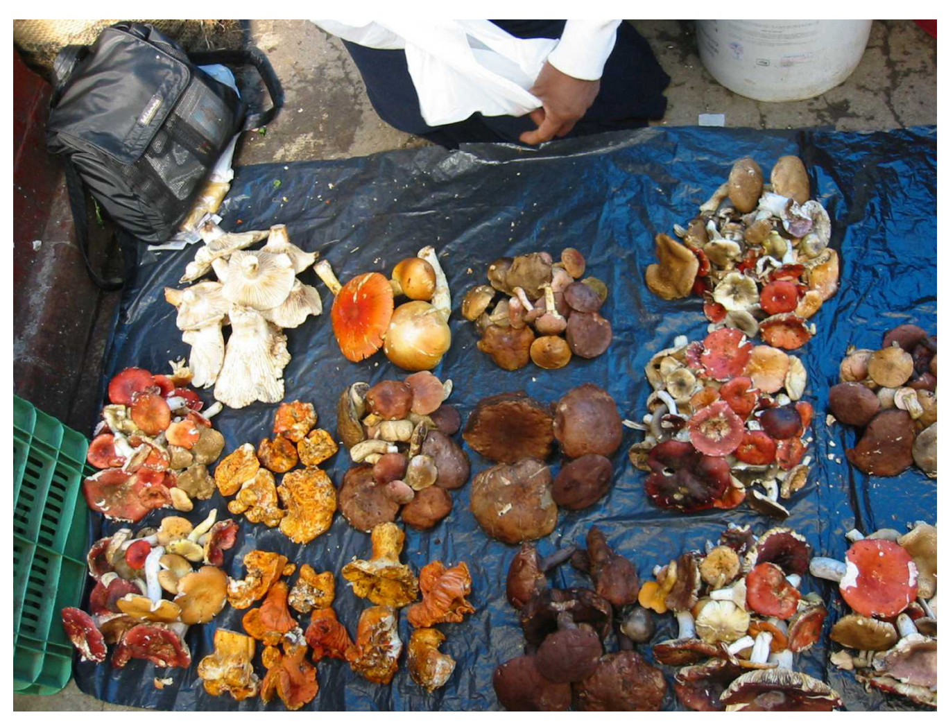
Figure 4 Typical wild mushroom stand in Temperate Mexico.

not sold) all sellers were mestizos. Moreover, Veracruz sellers had a limited environmental knowledge given their recent history as immigrants and colonizers.