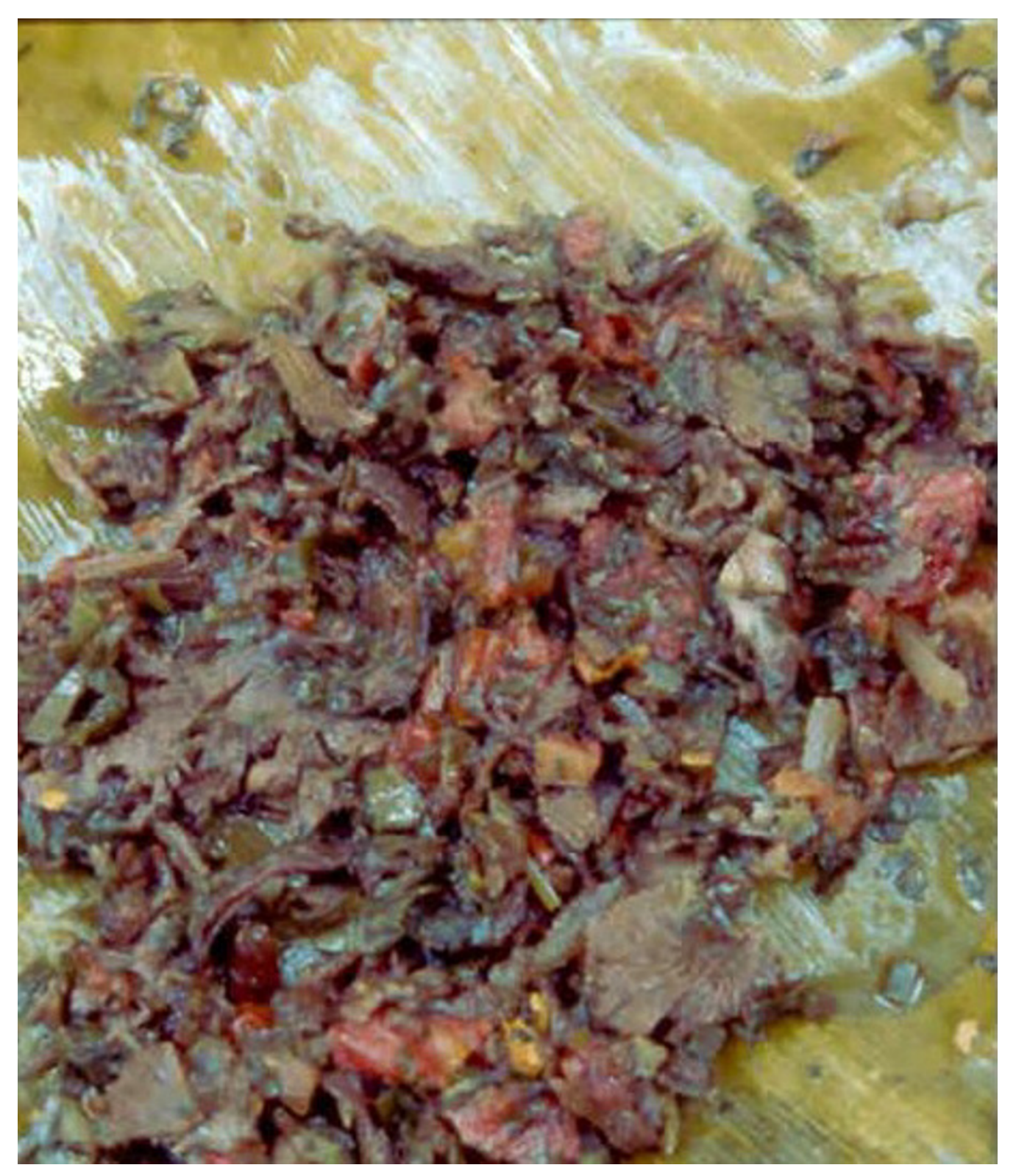
Figure 5 "Mone" a traditional meal made with mushrooms.