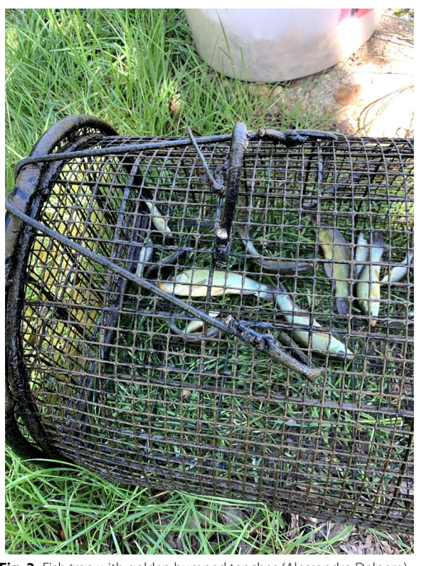
Fig. 3 Fish trap with golden humped tenches (Alessandro Delpero)

Fishing tenches out of a peschiera is an important material and cultural practice, subjected to collective rules and norms. Fishing rules have long been present in the area, regulating human-tench relations within a complex and dynamic system. At the beginning of the twentieth century, there were rules about minimal size and a ban on fishing in June, month in which spawning occurs. The fishing season goes from March to October. Fries, to be sold or gifted, are caught with the so-called trübia, a tight mesh net. Fishing tools for adult tenches include the bertavel (cylinder-shaped lobster pots or fish traps made with common osier, using a piece of bread, dry polenta, food remaining, eggs' shells as bait, 'almost anything would do') (Figs. 3, 4). 'Like pigs, tenches eat all the food scraps of the house' according to one interviewee. Fish traps are placed in the