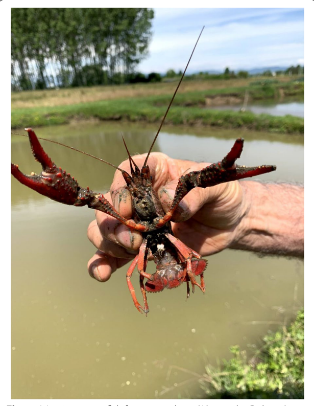
Fig. 7 A Louisiana crayfish from a peschiera (Alessandro Delpero)

Fig. 6 Peschiera with a system of crossing lines to prevent cormorants' predation on tenches (Alessandro Delpero)