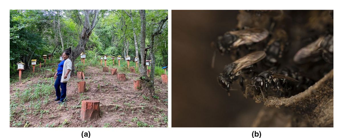
Fig. 2 A One of the interviewed meliponiculturists in her meliponary. B Scaptotrigona sp, known locally as Negro

Local stingless bee diversity and richness were analyzed using equations based on Hill numbers q=0 and q=1as proposed by Chao et al. [48]. Integrated extrapolation and rarefaction curves were developed, and thus, the estimated richness was calculated for each Hill number,